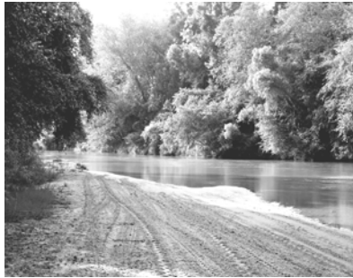
The Comite River is designated as a Louisiana scenic river

Why does East Baton Rouge Parish need a Greenlink System? Such a system can create an elaborate chain of public open space and be connected to a greater network of regional, state and federal systems. Greenlinks preserve natural areas, conserve plant and wildlife habitats, increase the aesthetic and property value of the area they serve, and reduce automobile use by providing a commuting alternative, thereby reducing traffic and air pollution. River and creek banks, drainage servitudes, lakeshores and parks are common sites for the Greenlinks because they are most often owned by the public.