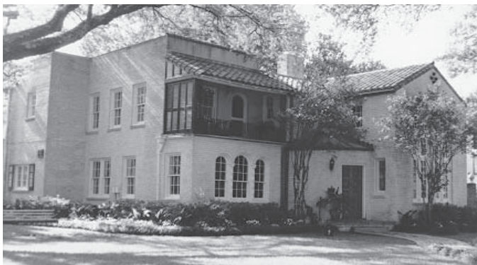
Above: This residential building is located in the Drehr Place National Register District. Drehr Place is significant in community planning and development.

The Historic Preservation Commission is recognized by the Louisiana Division of Historic Preservation to as a Certified Local Government.