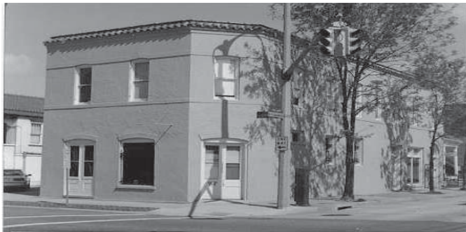
Above: Fonville Winans photography studio located in downtown Baton Rouge is an italianate commercial building on the National Register. This building is significant because of Winans history in the area.

The Certified Local Government (CLG) Program is a local, state and federal partnership that provides technical assistance and small grants to local governments who are seeking to preserve their architectural and cultural heritage for future generations.