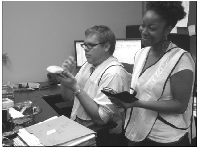
Interns play an integral role in GIS data development and maintenance.

The Planning Commission and the universities can both appreciate the value of working together with the intern program. The students receive “real” planning work experience while the Planning Commission benefits from