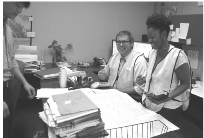
Interns work with and assist the Planning Commission Staff on a variety of projects.

Through this process students gain practical knowledge and experience of land use survey and analysis, data recording